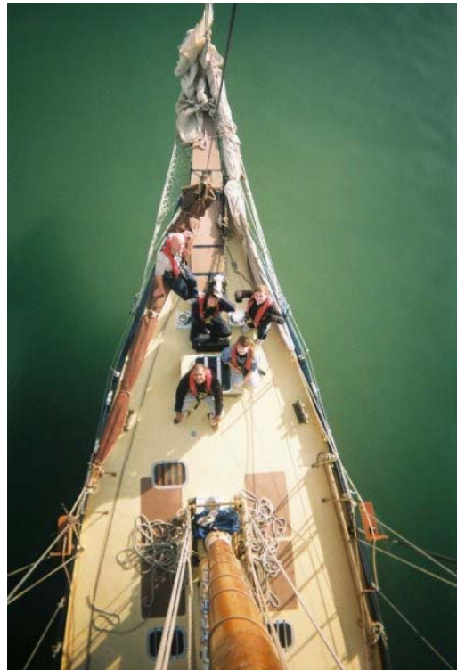
View from the top!

I am proud to be a Christian. I believe not only as a Christian, but as a scientist as well. A wireless device can deliver a message through the wilderness. In prayer the human spirit can send invisible waves to eternity, waves that achieve their goal in front of God."